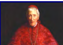
Blessed Cardinal John Henry Newman will be canonized on Sunday, October 13, 2019