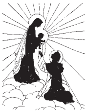
Our Lady of the Rosary Monday • October 7

(916) 725-2109 6335 Sunrise Boulevard Citrus Heights, CA 95610 www.PriceFuneralChapel.com