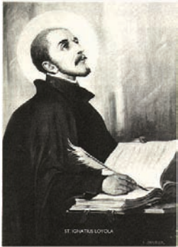
St Ignatius Loyola Saturday • July 31 st

St. Mary Cemetery & Funeral Center FD2263 Calvary Cemetery & Funeral Center FD2262