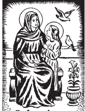
Saint Anne Mother of Our Lady Monday • July 26 th