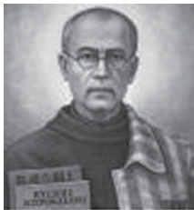
St Maximilian Kolbe

Call or text Virtual / in-person try before you buy! www.marykay.com/isabellec