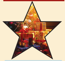
Table Decorating Contest!!!