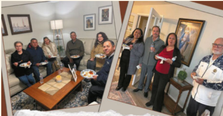
Inauguration Mass of the Rectory's Chapel