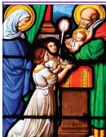
The Presentation at the Temple WORLD DAY FOR CONSECRATED LIFE

Sun Jer 1:4-5, 17-19; Ps Ps 71:1-2,3-4,5-6,15-17; 1 Cor 12:31-13:13 or 1 Cor 13:4-13; Lk 4:21-30 Mon 2 Sm 15:13-14,30; 16:5-13; Ps 3:2-3,4-5,6-7; Mk 5:1-20 Tue 2 Sm 18:9-10,14b,24-25a,30-19:3; Ps 86:1-2,3-4,5-6; Mk 5:21-43 Wed Mal 3:1-4; Ps 24:7,8,9,10; Heb 2:14-18; Lk 2:22-40 or 2:22-32 Thu 1 Kgs 2:1-4,10-12; 1 Chronicles 29:10,11ab,11d-12a,12bcd; Mk 6:7-13 Fri Sir 47:2-11; Ps 18:31,47 & 50,51; Mk 6:14-29 Sat 1 Kgs 3:4-13; Ps 119:9,10,11,12,13,14; Mk 6:30-34