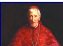
Blessed Cardinal John Henry Newman will be canonized on Sunday, October 13, 2019

WHY: Support the mission of SJV School while dancing the night away under the stars!