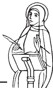
ST. TERESA OF AVILA Tuesday • Oct 15