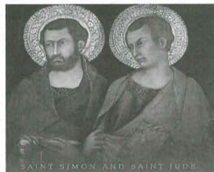
Saints Simon and Jude, Apostles: