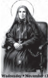
Wednesday • November 13