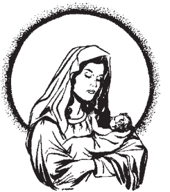
Mary, Mother of God Friday ❖ January 1 st

1 st Friday & 1 st Saturday This Friday & Saturday January 1 st & 2 nd