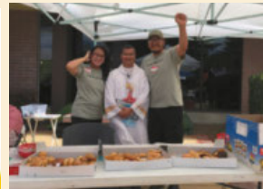
Meet Your Neighbor (Coffee & Donuts)

Meet Your SJV Ministries (more to come next week)