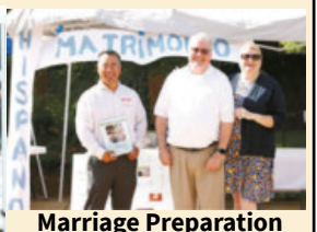
Marriage Preparation English / Spanish