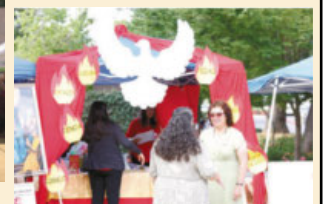
Grupo de Oracion

Behind Every Phone is a Person CALLED TO MAKE DISCIPLES