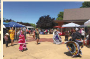
Grupo de Danza