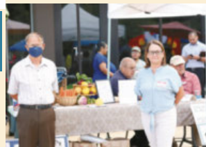
Rancho Cordova Food Locker