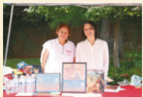
RCIA / Welcoming Ministry