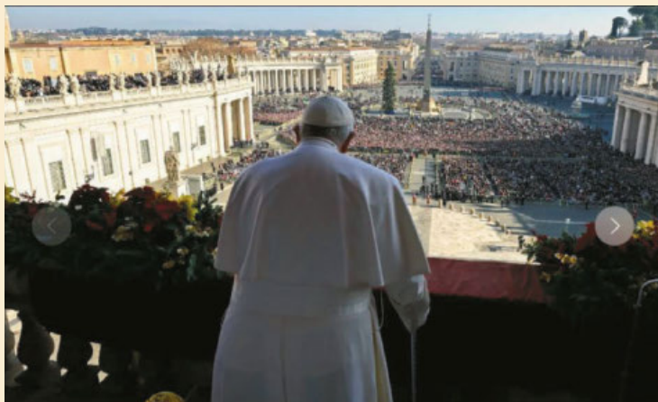
With a cane in his right hand, 86-year-old Pope Francis delivers his 10th Christmas "Urbi et Orbi" blessing on Dec. 25, 2022

Saturday: Heb 4:12-16; Ps 19:8, 9, 10, 15; Mk 2:13-1