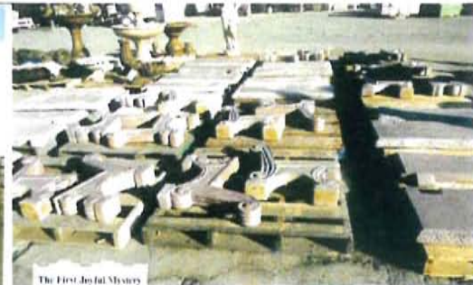
The First Joyful Mystery The Annunciation Mary said: I am the servant of the Lord. Let it be done to me as you say. (Lk 1:38)