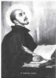
St Ignatius Loyola Wednesday • July 31