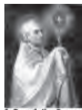
St Peter Julian Eymard Friday • August 2