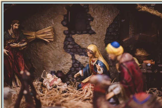
Nativity scene.

God of every nation and people, from the very beginning of creation you have made known your love: when our need for a Savior was great you sent your Son to be born of the Virgin Mary.